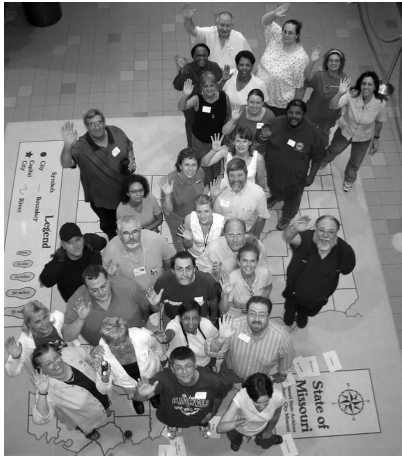
Participants in the recent compulsive gambling counselor training indicate the area of the state in which they reside by standing on a Missouri map located in the James C. Kirkpatrick State Information Center in Jefferson City.

I now know that the jobs of compulsive gambling counselors are never done – there are always crises and relapses that have to be dealt with and cases that are thought about even as they go to sleep at night. So, kudos to Missouri's compulsive gambling counselors, and thank you for your work and your compassion. Your work is helping to improve the lives of compulsive gamblers and their loved ones.